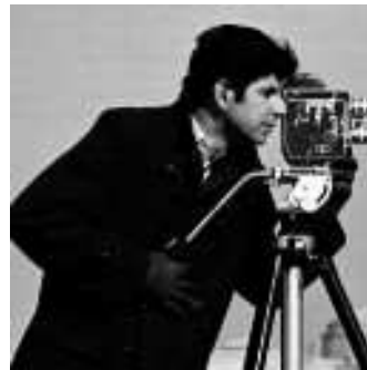
Fig. 4.1. The original “Cameraman” image.

The image “Cameraman” from the MATLAB toolbox is used in our experiments. The original “Cameraman” image is shown in Figure 4.1. An averaging function [17] is used to blur this image and a Gaussian white noise with the standard deviation 0.001 is added. The observed image is shown in Figure 4.2 (left).