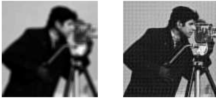
Fig. 4.2. The blurred and noisy image by the average blur (left) and the restored image (right).