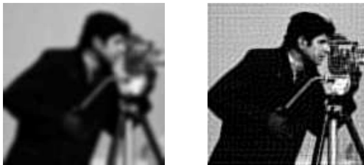
Fig. 4.3. The blurred and noisy image by Gaussian blur (left) and the restored image (right).