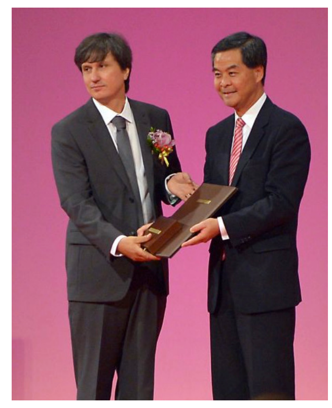
康采维奇在 2012 年邵逸夫奖领奖台上

下学习,更有幸见证八十年代中期共形场论(conformal field theory)和弦理论(string theory)的诞生,这些理论与理论物理学的发展息息相关,有着划时代的重大意义。大学毕业后,我在俄罗斯信息传输研究所担任研究员。那时候,我刚开始学大提琴,我非常享受跟我的音乐家朋友们一起演奏巴洛克及文艺复兴时期的乐章,就这样渡过了几年的快乐时光。