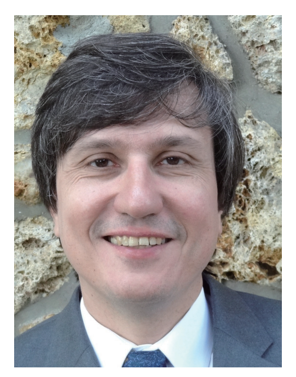
马克西姆·康采维奇 (Maxim Kontsevich)

我1964年出生于莫斯科市郊,周边是一大片森林。 我父亲是位著名的韩国语文及历史专家,母亲是位工程 师,现在已经退休,哥哥是电脑视觉专家。我幼年时候一 家人住在狭小的公寓里,家里放满了书,其中有一半是韩 文或中文书籍。