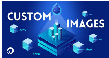
Figure 3: Example 3.

\begin{figure}[!tbh] \centering \includegraphics[width=40mm]{filename} \caption {Example 3.} \label{fig3} \end{figure}