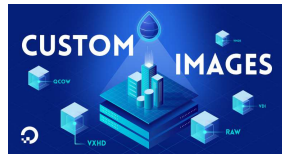
Figure 4: Example 4.

\begin{figure}[!tbh] \centering \includegraphics[height=2cm]{filename} \caption {Example 4.} \label{fig4} \end{figure}