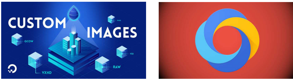
Figure 5: Example 5.

\begin{figure}[!tbh] \centering \begin{minipage}{0.45\textwidth} \centering \includegraphics[width=4cm,height=6cm]{filename}\\ \scriptsize{a)} \end{minipage} \begin{minipage}{0.45\textwidth} \centering \includegraphics[width=4cm,height=6cm]{filename}\\ \scriptsize{b)} \end{minipage} \caption {Example 6.} \label{fig6} \end{figure}