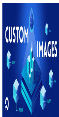
Figure 2: Example 2.

\begin{figure}[!tbh] \centering \includegraphics[width=1in,height=2in]{filename} \caption {Example 2.} \label{fig2} \end{figure}