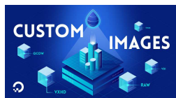
Figure 1: Example 1.

\begin{figure}[!tbh] \centering \includegraphics[scale=0.5]{filename} \caption {Example 1.} \label{fig1} \end{figure}